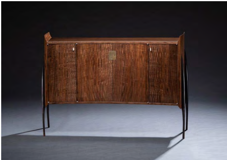
Athena , Clara Walnut, Curly Maple, bronze, mokume gane, 42" x 52" x 16", 2018

Selected Exhibitions As part of "In These Shoes: Bespoke Footwear in America", Dubuque, IA; Holyoke, MA; Brooklyn, NY; Connecticut Historical Society's Southern New England Apprenticeship Program 20 th Anniversary