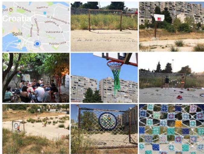
Soft Hajduk Post Soviet Queer Sport Public Space Reclamation , site specific installation, craft based techniques, 50' x 50' x 50', 2017

Selected Exhibitions Abigail Oglivy Gallery, Boston, MA; Barret Art Center, Poughkeepsie, NY; Space One Two One, Boston, MA; Kate Alkarni Gallery, Seattle, WA