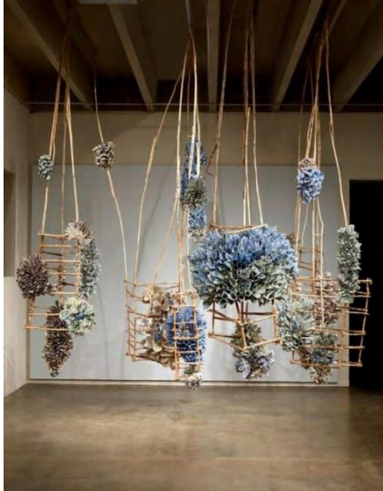
Tranquil Bloom , Fired and unfired paper clay, handmade paper, fibers, willow, 12' x 17' x 13', 2016

Selected Exhibitions SOFA Feature, Duane Reed Gallery, Chicago, IL; Tripp Gallery, West Chester, NY; BCA, Burlington, VT; DeDee Shattuck Gallery, Westport, MA; National Museum of Women in the Arts, Washington, D.C.; Canton Museum of Art, Canton, OH