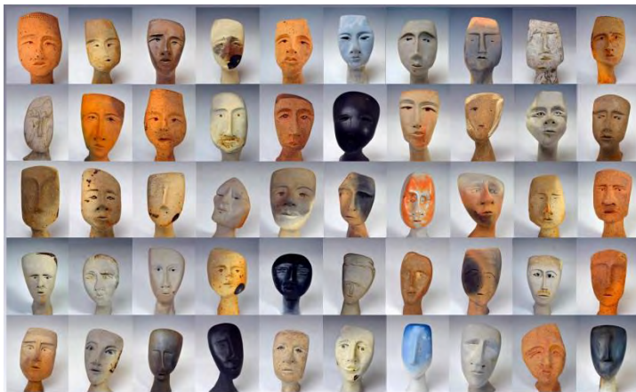
"All in the Same Boat" 2017