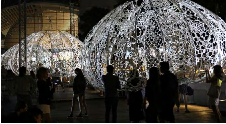
The Urchins 1 , Crocheted polyester rope, Dyneema, steel structure, 10' x 15' x 15', 2017

Selected Exhibitions Dongdaemun Culture and History Park, Seoul, South Korea; Deutsches Museum, Munich, Germany; Victoria & Albert Museum, London, England; Yale University, New Haven, CT