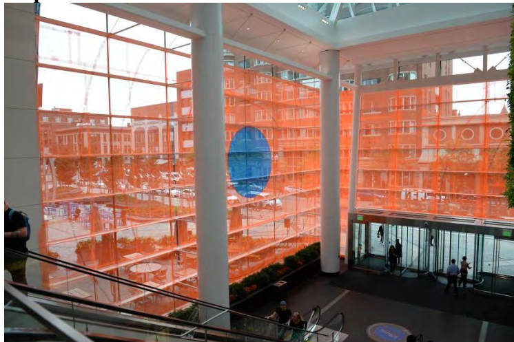
Unless , Repurposed construction debris netting, 34' x 63', 2018