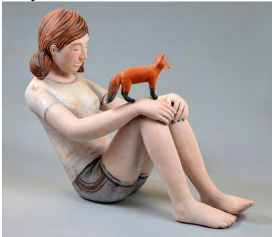
Guide to Somewhere , Terracotta, 21.5" x 11" x 26", 2016

Selected Exhibitions Dongdaemun Culture and History Park, Seoul, South Korea; Deutsches Museum, Munich, Germany; Victoria & Albert Museum, London, England; Yale University, New Haven, CT