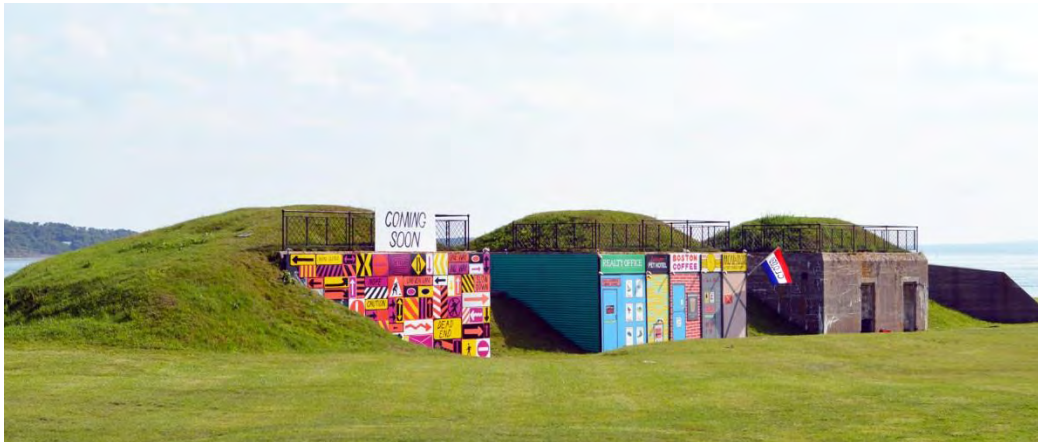
Untitled (Coming Soon) , Mixed media installation, 2015

Selected Exhibitions HUBWEEK, Temporary Public Installation, Boston City Hall, Boston, MA; Boston Center for the Arts Public Plaza, Boston, MA; Villa Victoria Center for the Arts, Boston, MA