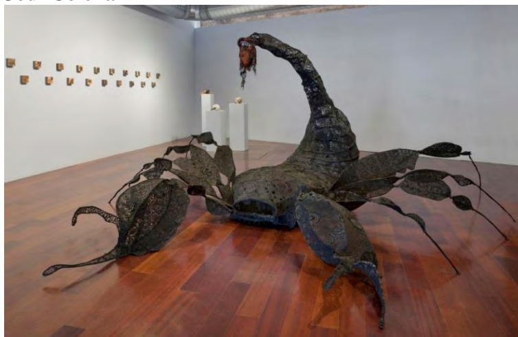
Stinger (aka Athena) , Found doilies dyed black and sewn onto an armature of wire, 7' x 24' x 17', 2018

Selected Exhibitions Boston Sculptors Gallery, Boston, MA; Form + Concept, Santa Fe, NM; Historic Northampton Museum, Northampton, MA; Danforth Art, Framingham, MA; Fountain Street Fine Art, Framingham, MA; Chandler Gallery, Maud Morgan Arts, Cambridge, MA