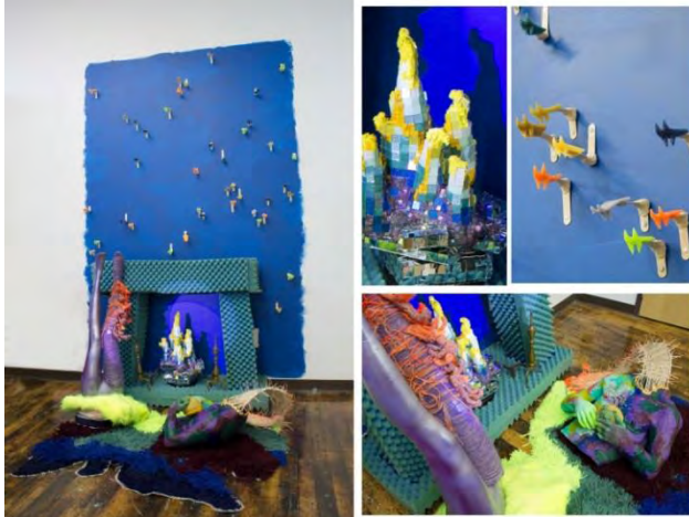
When the Night Turns... , Mixed media, 12' x 7' x 7', 2018

Selected Exhibitions Abigail Oglivy Gallery, Boston, MA; Barret Art Center, Poughkeepsie, NY; Space One Two One, Boston, MA; Kate Alkarni Gallery, Seattle, WA