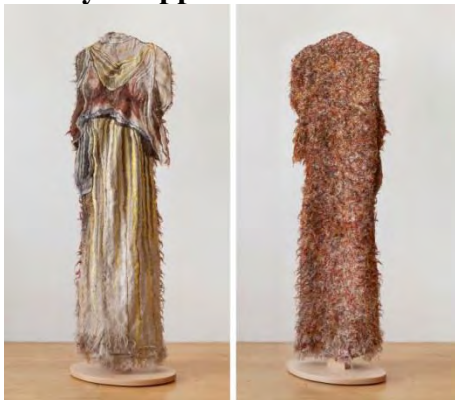
Never the Less She Persisted III , Cotton thread on linen, 60" x 19" x 10.5", 2017

Selected Collections New England Biolabs; Ipswich, MA; Houston Museum of Fine Arts, Houston, TX; Museum of Art and Design, New York, NY; Museum of Fine Arts, Boston, MA; Mary Ingraham Bunting Institute, Cambridge, MA; Miami-Dade College, Miami, FL