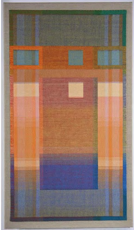
Inverse , Handwoven cotton fiber, 28" x 16" x 1", 2015

Selected Exhibitions American Craft Council, Baltimore, MD; American Craft Exposition, Evanston, IL; Craft Boston, Society of Arts and Crafts, Boston, MA; Smithsonian Craft Show, Washington, D.C., Philadelphia Museum of Art Craft Show, Philadelphia, PA