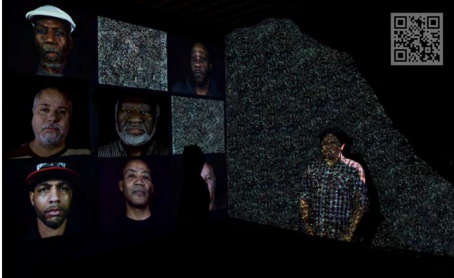
A Father's Lullaby , Video, sound, geolocated contributory website, 8' x 20' x 16', 2017

Selected Exhibitions HUBWEEK, Temporary Public Installation, Boston City Hall, Boston, MA; Boston Center for the Arts Public Plaza, Boston, MA; Villa Victoria Center for the Arts, Boston, MA