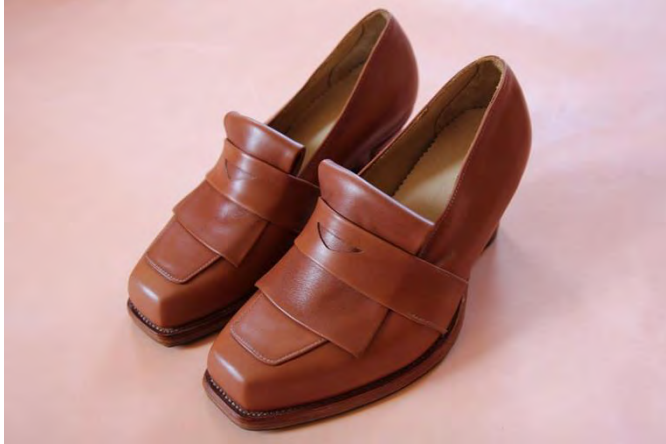
Carmel Loafer Pump , Leather, thread, ink, wax, wood, rubber, glue, 4" x 4" x 10", 2018

Selected Exhibitions As part of "In These Shoes: Bespoke Footwear in America", Dubuque, IA; Holyoke, MA; Brooklyn, NY; Connecticut Historical Society's Southern New England Apprenticeship Program 20 th Anniversary