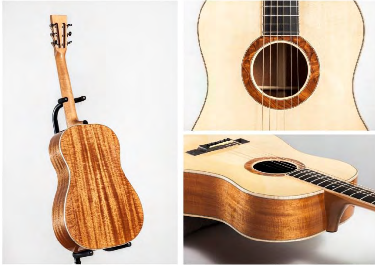
Steel String Acoustic Guitar (detail) , woodworking, 38" x 14" x 4", 2015