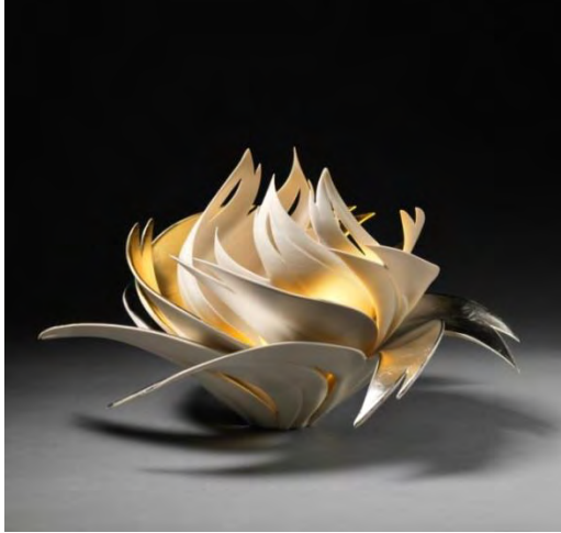
Gilded Lotus Nest , Porcelain, 24 carat gold leaf, palladium leaf, 10"x 16" x 16", 2018

Selected Collections Renwick Gallery of the Smithsonian American Art Museum, Washington, D.C.; American Museum of Ceramic Art, Pomona, CA; Philadelphia Museum of Art, Philadelphia, PA; Brooklyn Museum of Art, Brooklyn, NY; Baltimore Museum of Art, Baltimore, MD